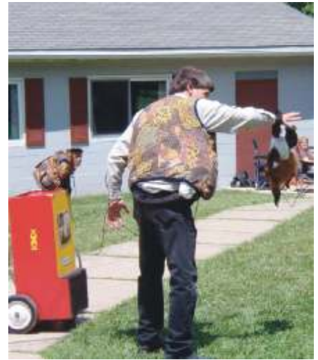
Just a little monkeyin' around!

It was a delight to see the enthusiasm and happiness expressed by family members, especially the children, as they shared some wholesome recreation and fun with their loved ones.