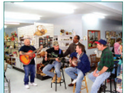
Treatment center clients perform music for customers during the New Destinations Thrift Store open house

To donate to the thrift store clothing or other items in good condition, please bring your donations to the store at 1230 Wooster Rd., Barberton, Ohio. We will pick up furniture or appliance donations. For donation pick-up, please call the store at (330) 706-9092.