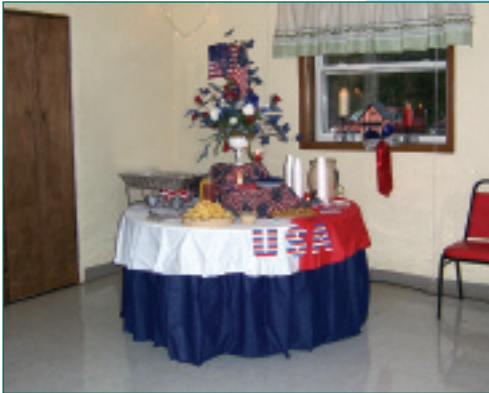
The NDTC dining hall features ethnic and multicultural cuisine and decorations for the 2005 volunteer appreciation banquet.

the hard work performed by our volunteers. The ministry could not continue serving men trapped by addiction without the skills and talents that have been lovingly contributed by our faithful volunteers.