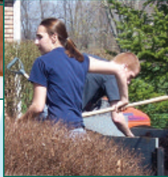
Members of the Heritage Christian School Beta Club diligently work at pulling weeds, spreading fresh mulch around the shrubs and washing windows at NDTC.